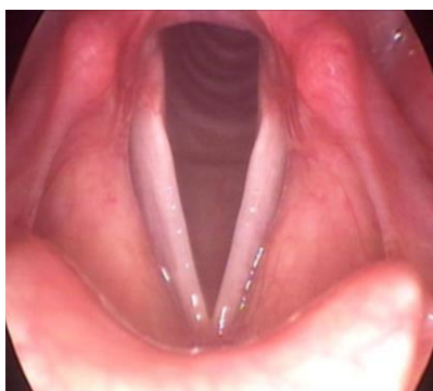
Picture 1. Healthy Larynx at rest

Vocal cords sit in the voice box (also known as your larynx or Adam's apple) at the top of the wind pipe. Pictures 1 and 2 are photos of healthy vocal cords.