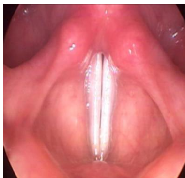
Picture 2. Healthy larynx producing voice

In order to produce voice, we bring the vocal cords together (see picture 2) and gently blow air through them from the lungs below, which causes their delicate membranes to vibrate. This vibration is the sound of the human voice.