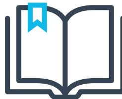
Resources to record your blood glucose and insulin