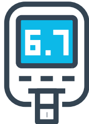
Blood glucose meter with strips & lancets