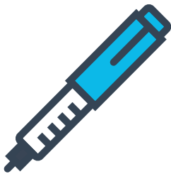
Insulin, needles and pen device

The hospital should provide you with an information starter pack along with everything you need to safely manage your insulin: