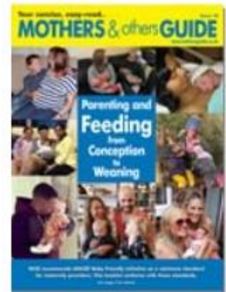
Mothers and Others Guide

You can search online "UNICEF antenatal hand expression" to find helpful videos and more information.