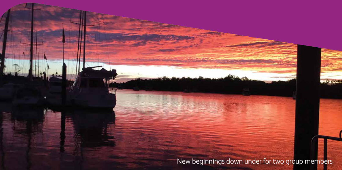
New beginnings down under for two group members

SCA UK are supported by the cardiac charity SADS UK.