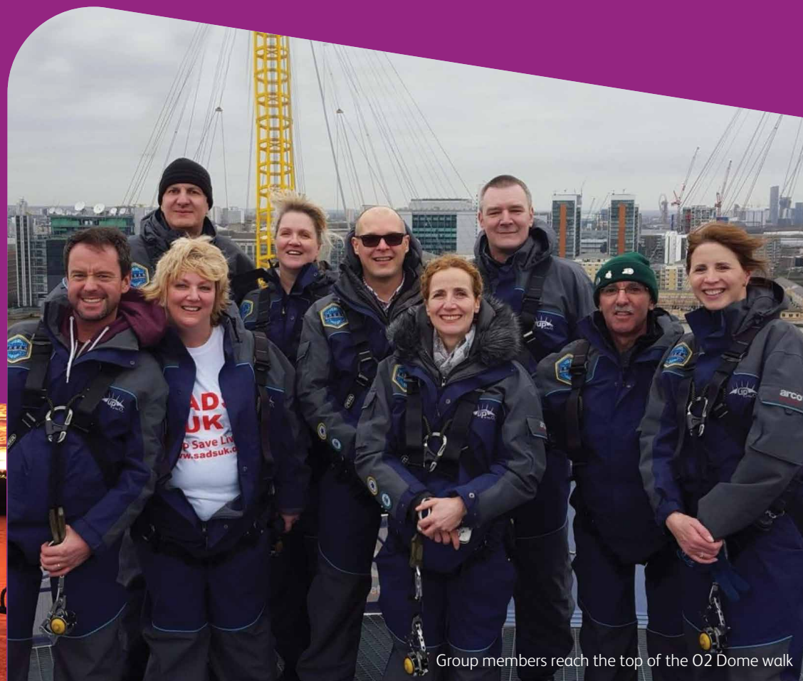
Group members reach the top of the O2 Dome walk